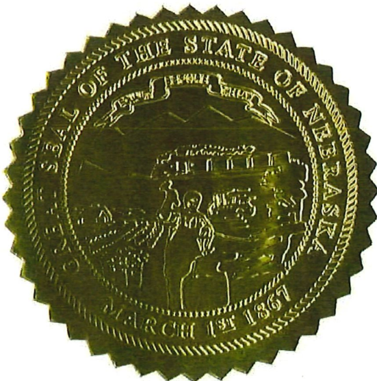
Pete Ricketts, Governor State of Nebraska

IN WITNESS THEREOF , I have hereunto set my hand and caused the Great Seal of the State of Nebraska to be affixed on this 19th day of May, 2020.